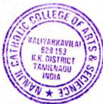
PRINCIPAL Nanjil Catholic College of Arts & Science Kaliyakkavilai - 629 153.